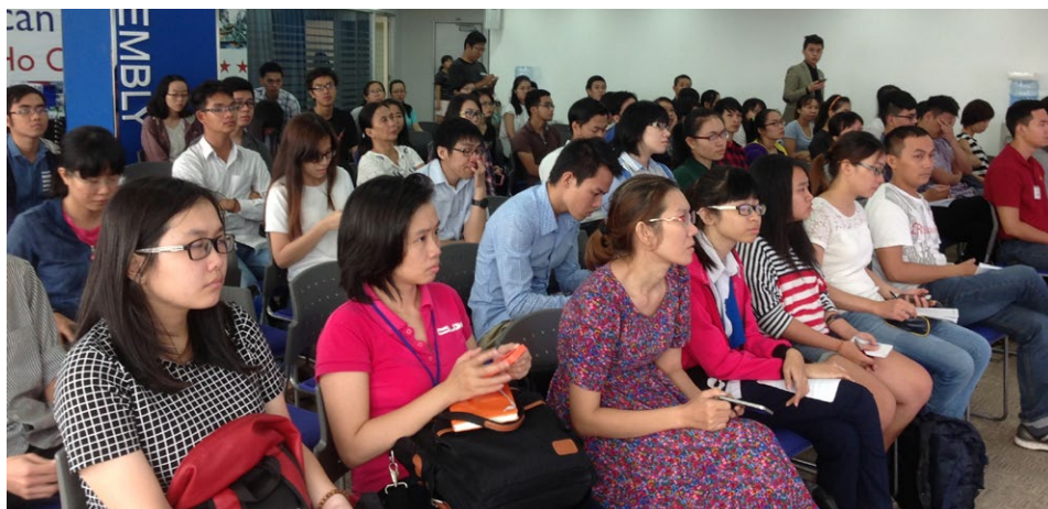
More than 50 Vietnamese students hoping to pursue master's degrees in the U.S. attended the information session.