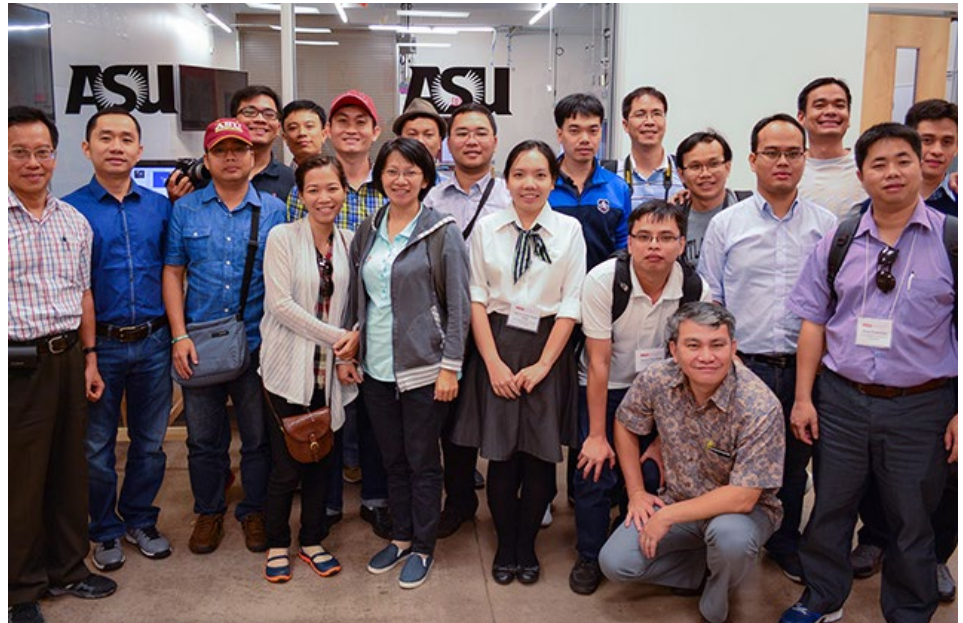
A cohort of 20 instructors from the Vietnam National University-Ho Chi Minh City system visited Arizona State University in fall 2015 to learn more about the emerging field of Internet of Things. The Internet of Things is a development concept in which everyday objects have network connectivity and the ability to transfer and receive data.

From 2010 to 2015, the program has trained more than 400 lecturers at ASU who, upon returning to Vietnam, are teaching and graduating work-ready