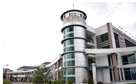
Saigon Hi-tech Park Training Center, the location of the third annual conference.

The presentation underlined the high demand for a workforce skilled in IoT solutions and highlighted the value of a mandatory course aimed at familiarizing undergraduate students in the fundamentals of IoT. With Vietnam and HCMC committed to the Smart